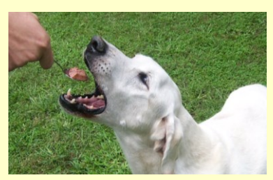
Timmy opens wide for his twice daily regimen of six different prescription drugs.

Many of the animals are on prescriptions that are to be given every 12 hours. This means that each day at Hallie Hill begins and ends with the administration of medications. Daily medicines include insulin for diabetes, Rimadyl for arthritis,