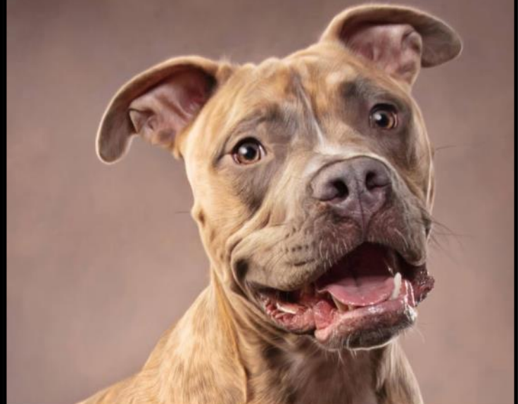
HALLIE HILL ANIMAL SANCTUARY Bring your Fur Family to us and help Hallie Hill too! One week ONLY! Dec 1st - 5th, 2020 WWW.CASTELOPORTRAITART.COM

Make your appt. now! Take your fur babies for portraits and support Hallie Hill! Click <u>HERE</u> for more information on our fundraiser with Castelo Portrait Art! *****