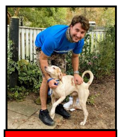
Tucker thanks the Conrad Family!