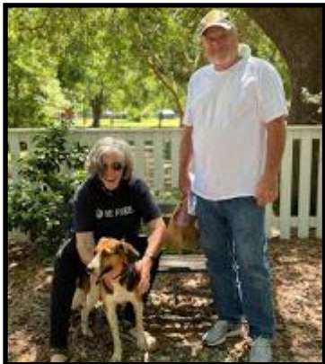
Gumbo thanks the Price family!