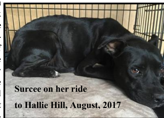
Surcee on her ride to Hallie Hill, August, 2017

This month I want to share the story of one special little girl at the Sanctuary. Last August I was called to a home because the owner had 2 litters of puppies and many of them were dying. One momma dog (a very confident white and brindle pit) ran around 'off leash' and lived in the house. The other momma dog was tied to a chain in the back yard. The owner had taken the puppies away from the "outside momma" because she said the mother was killing them. When I examined the puppies, it was easy to see they all had a heavy burden of intestinal parasites. All but two puppies from the momma on the chain had passed away, and the 2 remaining were so anemic they would not have made it another day without veterinary care. The owner agreed to surrender the two sick puppies to Hallie Hill but did not want to give up the other puppies (they could be sold). She did not want to spay the momma dog that lived inside. But she readily surrendered the "outside momma." It was evident there was no bond between the woman and this nondescript black pit bull mix that cowered as low as possible - flattening herself like a pancake when someone approached.