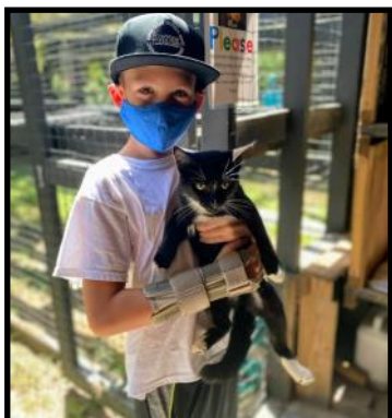
Queso also thanks the Rogers Family!