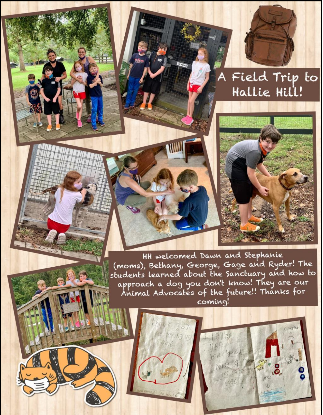
A Field Trip to Hallie Hill!