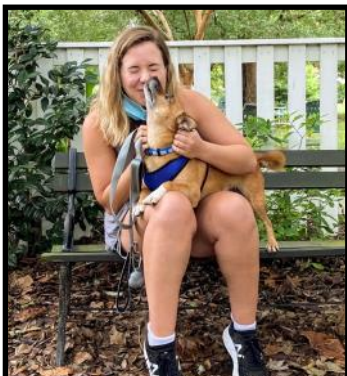
Django thanks the Prewitt Family!