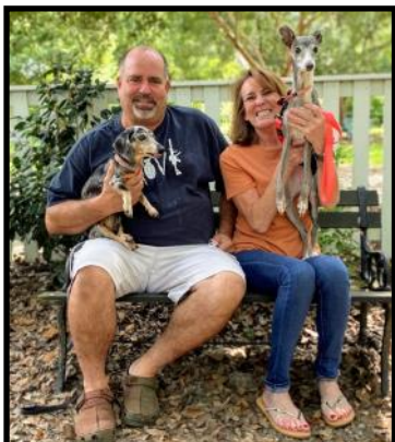
Cricket thanks the Cooper Family!