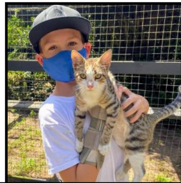
Lila thanks the Rogers Family!