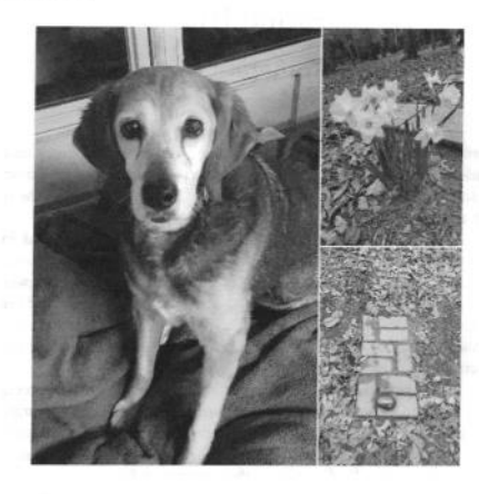
Flossie - and Angel's Crossing

animals in our community! Slowly, things are getting back to a "new" normal for us.