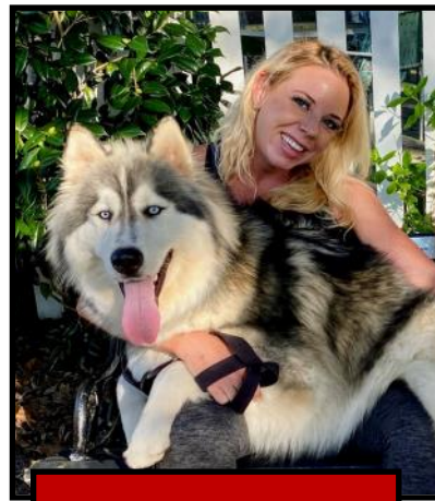
Grey thanks the Moore Family