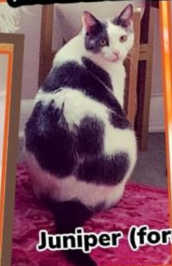
Juniper (formerly Moo Shoo)