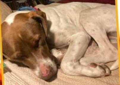
Max (Formerly Willy)

"I just have to let you know how we love this sweet dog. My husband just said tonight, 'I've never seen such a loving dog', and he is that. Thank you for all your work at Hallie Hill. He's lying on my bed next to me. He's gained maybe a little weight, but mostly is just soaking into our dog family and our lives!" (Max, formally Willy)