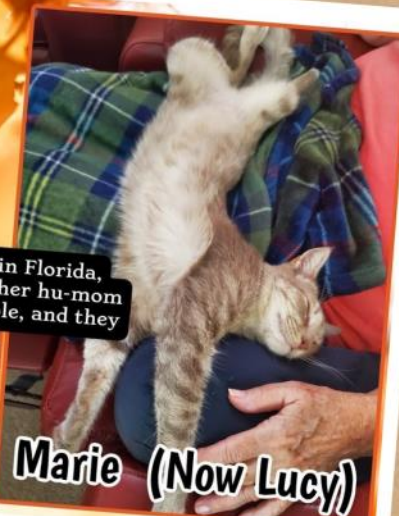
Marie (Now Lucy)

Lucy is living her best life in Florida, bringing joy and laughter to her hu-mom and dad! She LOVES her people, and they love her! 🐾