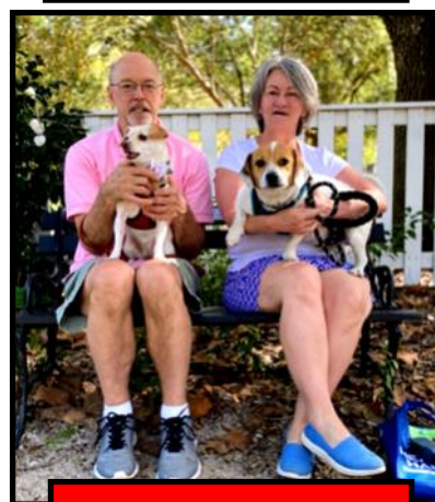
Beethoven thanks the Allen Family!