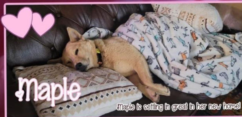
Maple is settling in great in her new home!

"Maple is doing great! She loves playing with Dog. They really like having this laid down "fights." We call them thumb wars. She's excellent with the cats, and even Cass will stop being grumpy enough to play with her from time to time. She takes to anything very quickly. She's excellent in a kennel, and didn't need any potty training. She has proven to be a very smart dog and an excellent addition to our family. Thank you so much for all that you do and we are so happy to have our little Maple."