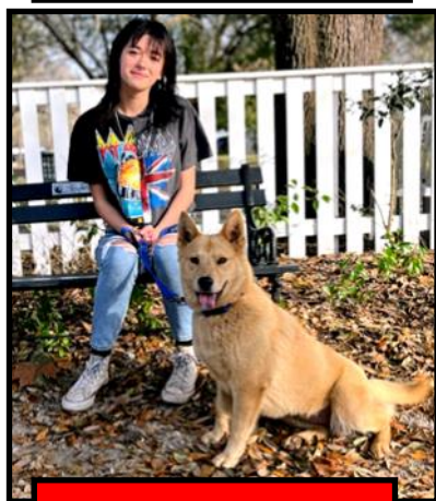
Maple thanks the Milton Family!