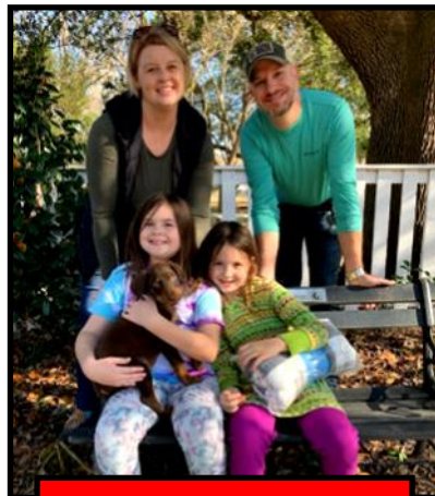
Silver (Gus) thanks the Chisholm Family!